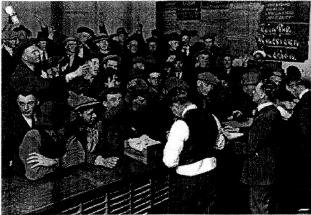
Figure 1: Unemployed men vying for jobs at the American Legion Employment Bureau in Los Angeles during the Great Depression.

The 1929 stock market crash set into motion a series of events that plunged America into its greatest economic depression. By 1933, the country's gross national product had been nearly cut in half, and 16 million Americans were unemployed. Not until 1937 did the New Deal policies of President Franklin Roosevelt temper the catastrophe. This economic downturn persisted until the massive investment in national defense demanded by World War II.